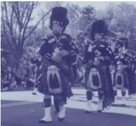
Pipers are an Apple Festival tradition.