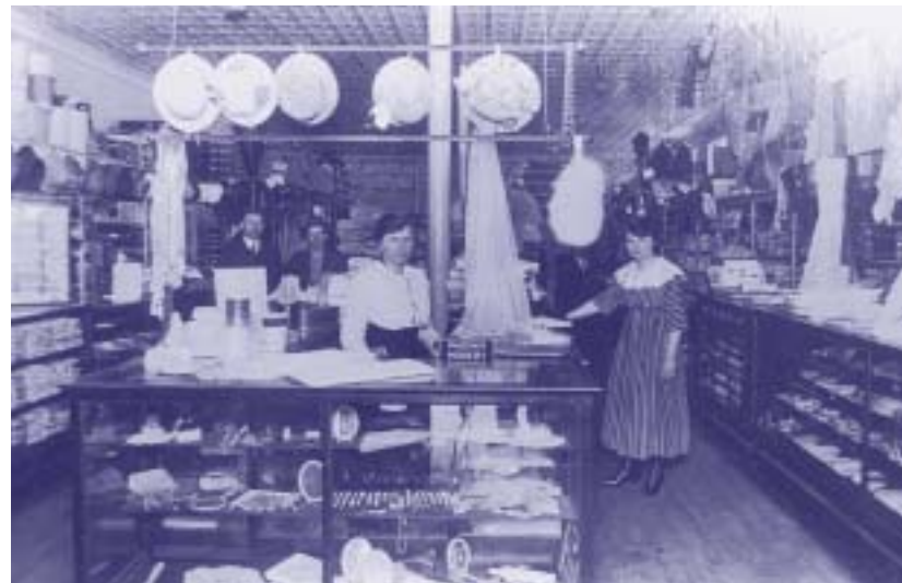
Top: Logging days. Above: Clothing store interior in Bayfield.

OBJECTIVE 4.1: Preserve the City's Historic District and the historic structures within it. OBJECTIVE 4.2: Preserve the architectural character and unique "look" of Bayfield. OBJECTIVE 4.3: Ensure that the region's cultural resources are an integral part of the City's economic development plan. OBJECTIVE 4.4: Increase awareness of local and regional history and culture. OBJECTIVE 4.5: Provide support for youth, senior and inter-cultural community activities.