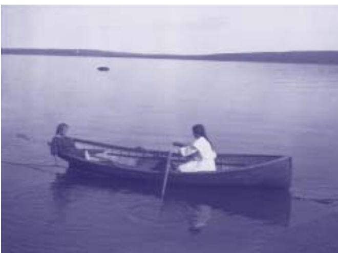
A leisurely summer day in the early 20th century expresses the same essential quality of life in Bayfield today.