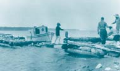
Above: A community that has always traveled by water.