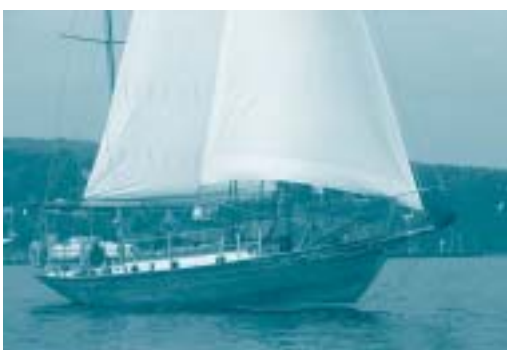
Top: Apostle Island sailing is known as some of the best in the world.