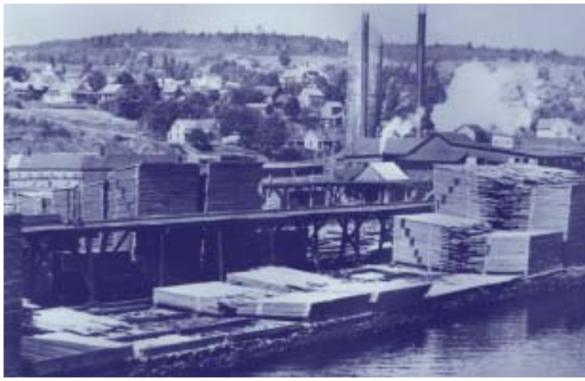
Lumbering was a major industry in the area from the 1880s to the 1920s.

OBJECTIVE 7.1: Install cost efficiency, combined with excellent service delivery in all public service endeavors.